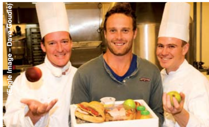
(Eagle Image - Dave Goudie)